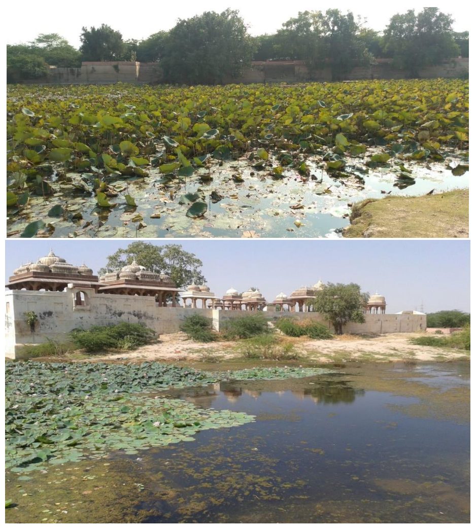
Figure 1: Devikund Sagar Pond

The catchment area of these ponds receives rain water during the monsoon as well as in other season has surround from three sides by bricked wall.